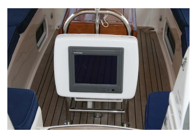
Cockpit Nav Screen