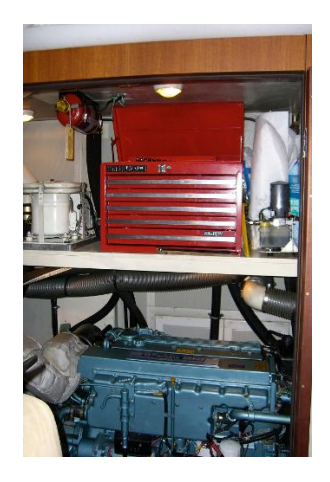
Engine Room with Tool Kit