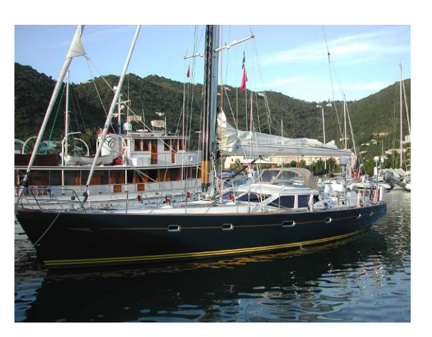
At Dock in the BVI's