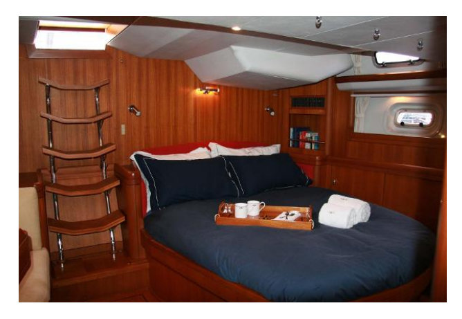
Master Stateroom, Aft