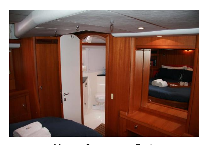
Master Stateroom, Fwd.