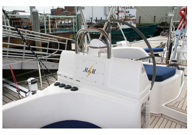
Helm Furler Controls