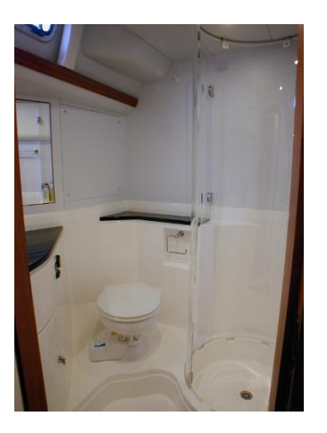
Master En Suite Head