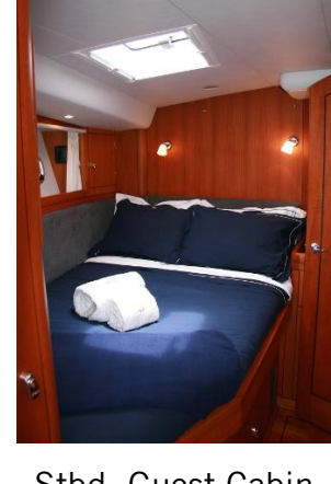
Stbd. Guest Cabin