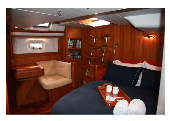
Master Stateroom, Stbd. Side