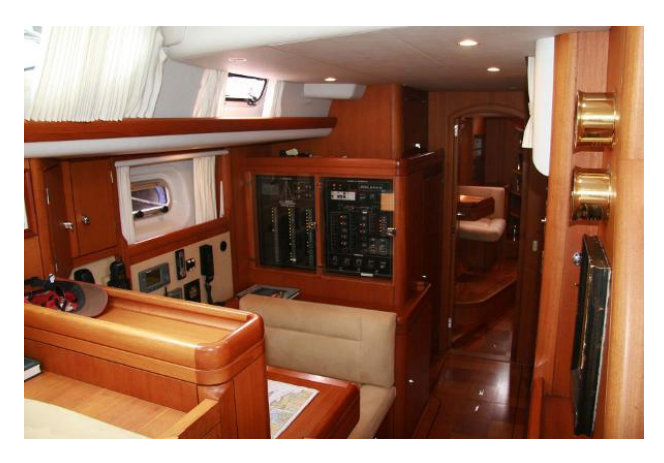
Nav Station, Aft Passageway