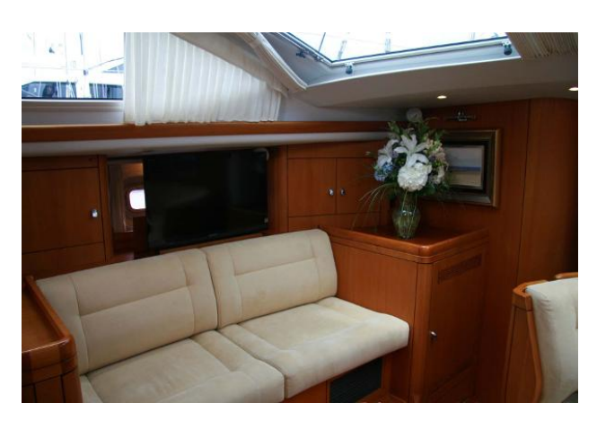
Main Saloon, Port Side