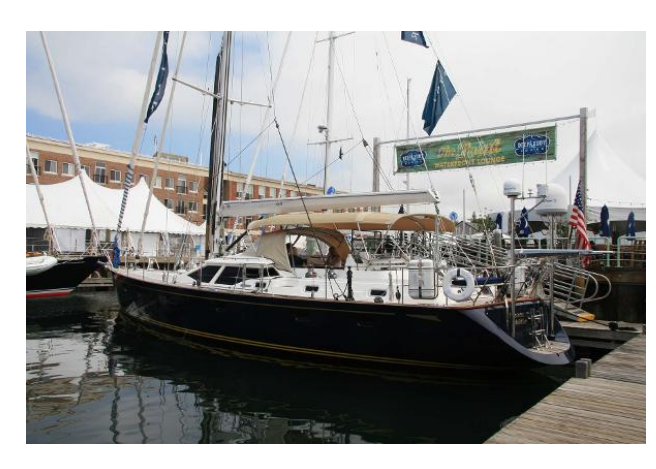
Port Aft Quarter